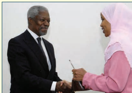
Salzburg speaker Kofi Annan, former Secretary-General of the United Nations, and a seminar participant