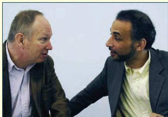
Salzburg Faculty members Ian Buruma and Tariq Ramadan at Immigration and Inclusion