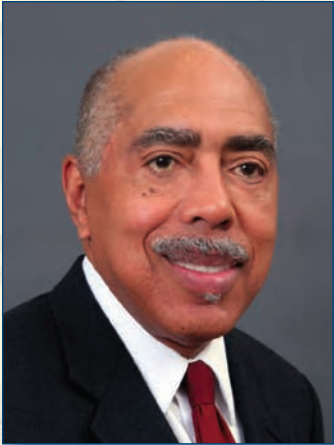
Walter E. Massey

Like many others before and since, I became enamored of the Salzburg Global Seminar upon my introduction to it in 1995. At the time, I was invited to a special board-sponsored weekend where I experienced, firsthand, what I had only heard about previously. I was hooked. The Seminar's ability to convene rising leaders of different backgrounds, from different parts of the world, and to challenge them to engage deeply with one another on critical subjects was — and remains — unparalleled. I was subsequently invited to join the Board of Directors, and accepted without hesitation.