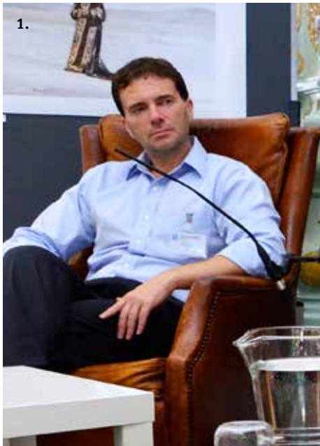
1. Tobias Wolff