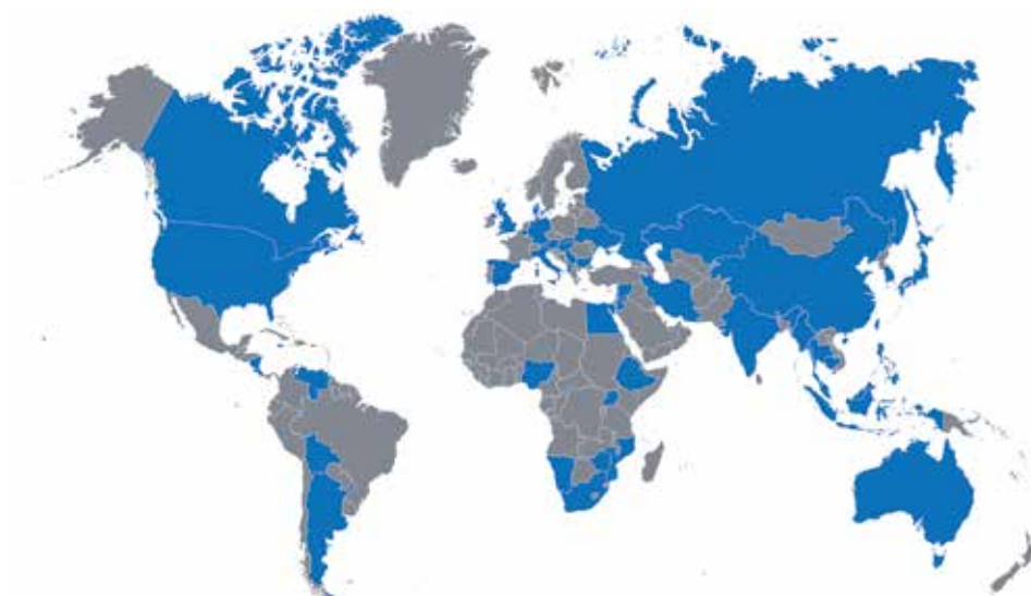
Countries (in blue) represented in the Salzburg Global LGBT Forum

The 2013 launch of the Forum brought together 60 participants to Schloss Leopoldskron, home of Salzburg Global Seminar. Under the theme LGBT and Human Rights: New Challenges, Next Steps , five topics guided discussions: Mainstreaming by expanding rights and opening spaces dominated by heteronormativities; Connectivity and the opportunities or setbacks of the Internet for global and local initiatives; Security and ways to improve safety, health and life protection for LGBT communities; Education access to or exclusion from it; and finally Identity and its implications for transgender,