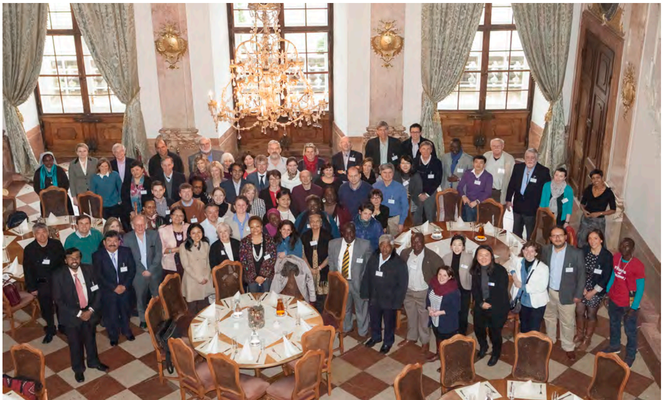
Fellows of the Salzburg Global Seminar program New Paradigms for Behavioral and Mental Health Care

Although we are working on systems-level care with contexts that reach across the planet, maybe this all is built on one simple premise: every single person matters. None of this is possible unless people rigorously care about the wellbeing of relative strangers. Perhaps this is the guiding theme that emerged from this week and will help inform the upcoming health care sessions in this Salzburg Global series.