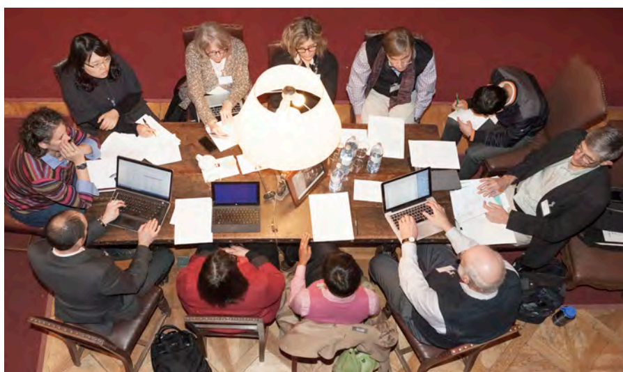
The USA team in the Reinhardt Library

In light of the resource polarity in global health, the conversation moved towards possibilities that could offer relief in either extreme. Instead of waiting for more specialists to arrive, both contexts could