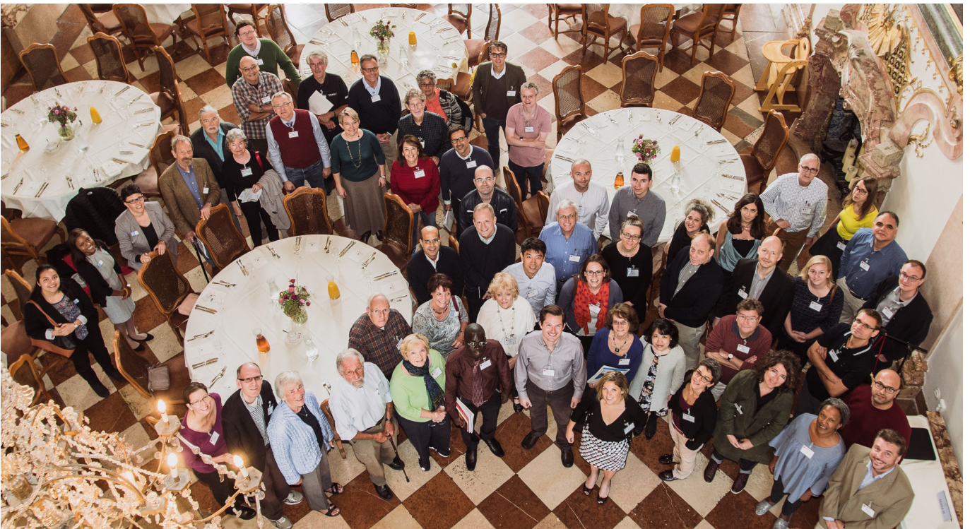
Fellows, faculty, speakers and staff of SSASA 15

On the international front, panelists felt that some nations see a rebalancing act in progress. Mixed signals, however, lead to feelings of neglect and confusion. Nations seek reassurances and strive for continuity, it was maintained. A lack of confidence leads to hostility and suspicious understandings.