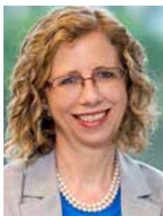
Inger Andersen Denmark (via Skype)

(Titles and bios current at time of session – November 2015)