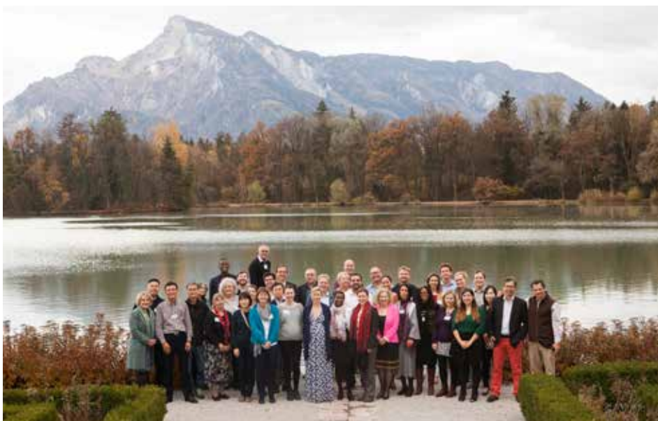
Fellows and faculty of Session 557 Parks for the Planet: Nature, Health and a New Urban Generation pose for the traditional group photo on the terrace of Schloss Leopoldskron against the backdrop of the Untersberg mountain

In their statement, the participants committed to catalyzing and nurturing “new ways of working together to secure the right for all people to experience and be excited by nature and gain lifelong benefits for health and wellbeing from outdoor activities in varied and stimulating environments.” Additionally, they seek to “foster new leadership to conserve nature as the foundation for sustainability in an era of rapid global change.”