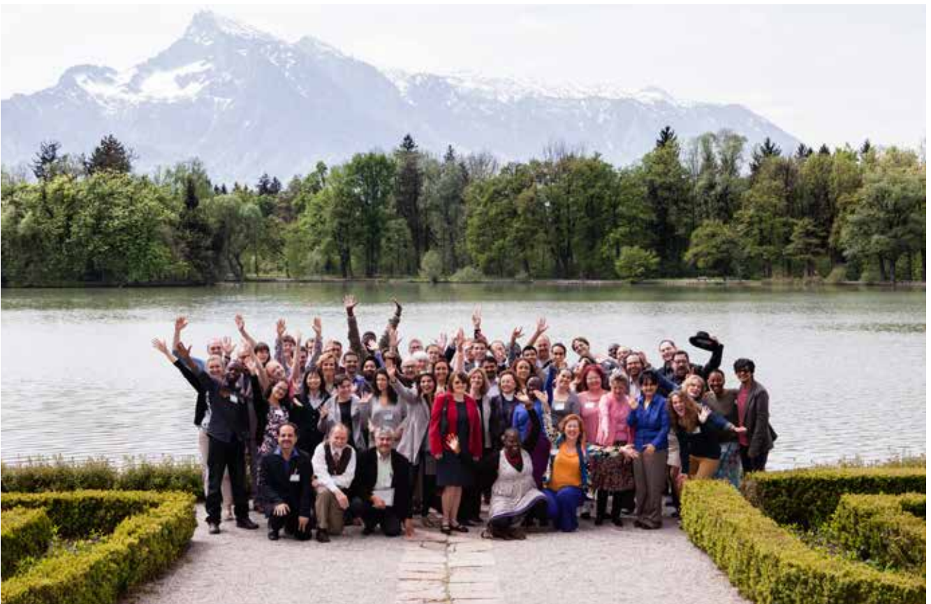
Salzburg Global Fellows of the session Youth, Economics, and Violence: Implications for Future Conflict

Building on our mission to challenge present and future leaders to solve issues of global concern, Salzburg Global Seminar seeks to sustain and accelerate regional dialogue and project hubs to generate solutions that are locally sourced, target system change, and inspire youth to action. Our Fellows' proposals [page 34] provide a critical framework for next steps on international and regional engagement and investment, which will guide our future work with partners and change-makers. Looking forward, we hope to catalyze and support efforts that not only transform perceptions of youth but also help change those systems that suppress youth voice, agency, and hope.