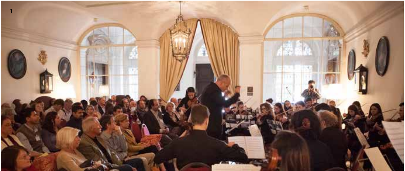
Fellows enjoy the traditional session concert, on this occasion given by the youth orchestra Bella Musica