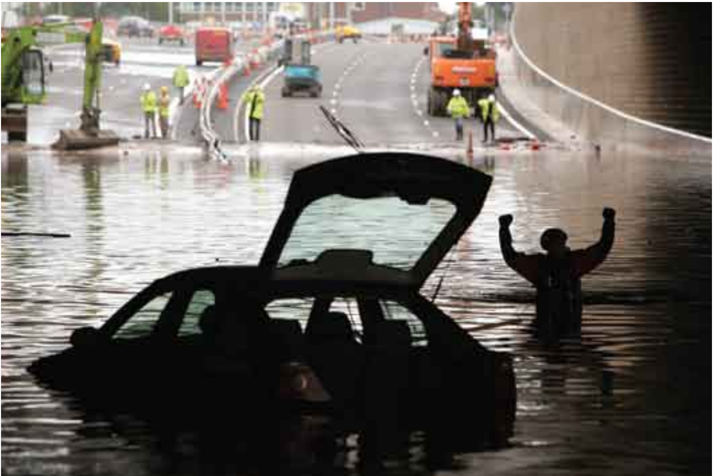
▼ A member of the Northern Ireland Fire and Rescue checking the flooded Broadway underpass

The relationship between flooding crises and the demand from the public for a policy response is well known (Tobin and Montz 1997). In fact, it takes a severe flood for flooding to be prioritised on the political agenda (Johnson, Tunstall and