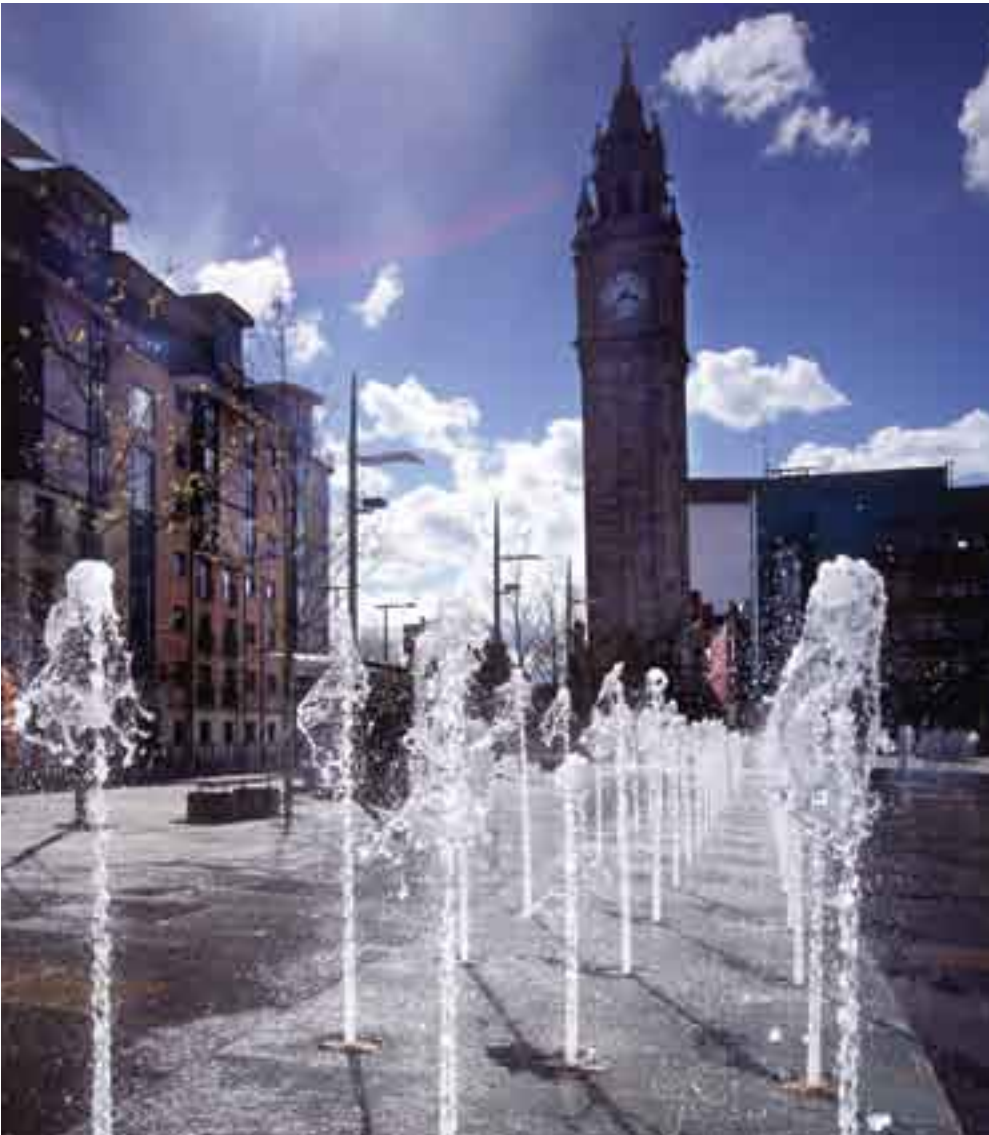
▼ The Albert Memorial Clock and water jets in Queen's Square, Belfast

A different technique for data collection was chosen when interviewing people directly