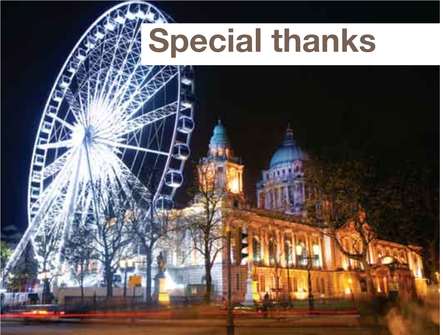
▲ Night view of the Belfast Wheel and Belfast City Hall

Sincere thanks to all the people who contributed to this research including representatives of the emergency services, statutory agencies, voluntary and community organisations. We would particularly like to thank the people who have been affected by flooding and whose stories underpin this research.