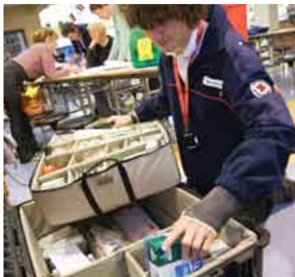
◀ A young Red Cross volunteer prepares a first aid box for every eventuality