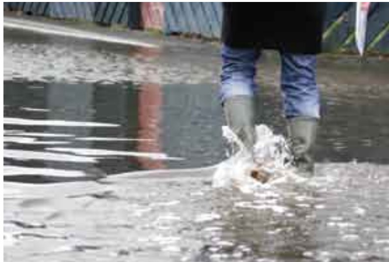
◀ Prepared for floods