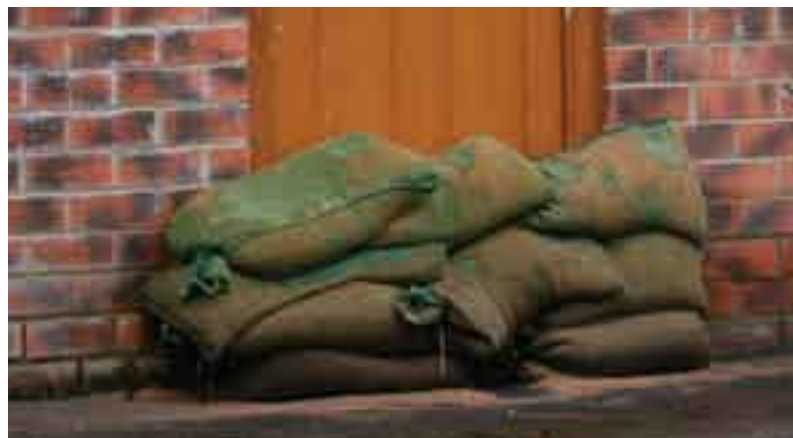
◀ Sandbags help reduce water damage

The research identified good examples of local resilience initiatives in areas that have experienced repeated flooding. Participants spoke of the "need to do something" for themselves because of the slowness of response. For example, a community group on the Lower Ormeau Road, south Belfast used the local sports hall to store and dry out belongings, and secure furniture and people's possessions. They have also identified the elderly in their community. In Ardgowan Street, east Belfast, a local flute band engaged a contractor to make sandbags and distribute them to residents. In areas with poor community networks, however, the experience of flooding is likely to be exacerbated, particularly with people who have pre-existing vulnerabilities.