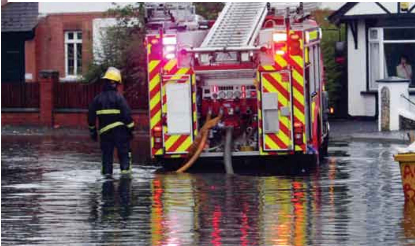
▲ Fire services helping in a flood-affected residential area in Belfast

As severe flooding incidents occur increasingly across the UK, a growing body of literature is emerging from both academic and policy perspectives. This section introduces some of the key documents in this area, including external studies and papers from British Red Cross experience. The literature presented will focus on the themes of response, recovery, health impacts, policy developments and vulnerability.