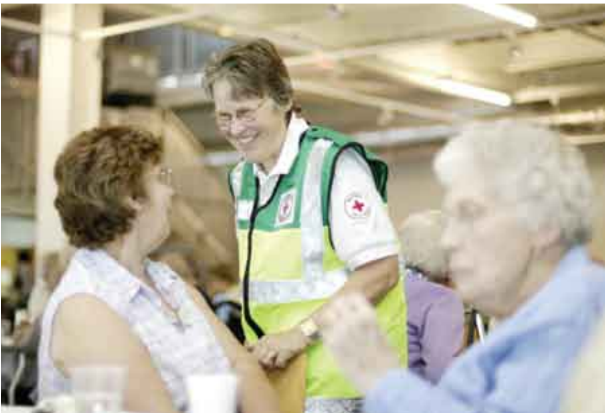
◀ Red Cross volunteers give practical and emotional support to people affected by floods

To maintain the reliability of this study, the aim was to tape record all interviews. This was not possible in every case, so it became necessary to take notes during some interviews and develop them immediately afterwards. The research project has also provided an account of the methods adopted for data collection and how the data was analysed.