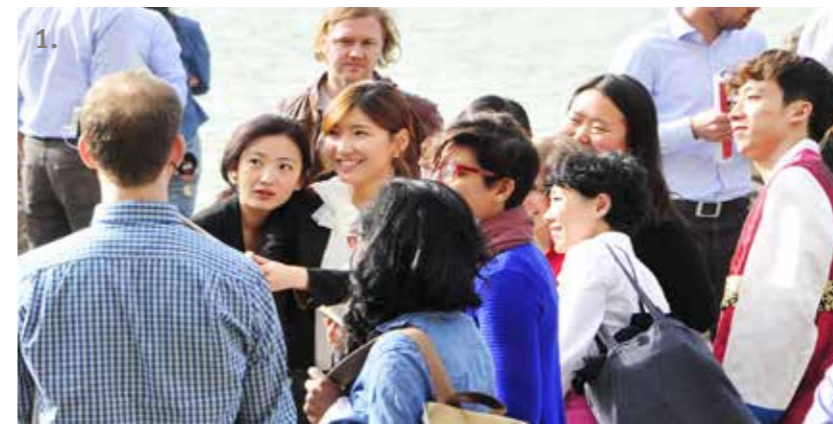
1. YCIs gather for a “selfie” before the official group photo

Salzburg Global Seminar and the 45 young cultural innovators who came together for a week at Schloss Leopoldskron in Salzburg are committed to making this happen.