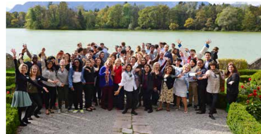
Salzburg Global Seminar Young Cultural Innovators 2014

Many of them have their work cut out. They’re working in places where it’s hard to find time, money and allies – places like Tirana, Phnom Penh and Athens. But cultural innovators have it tough