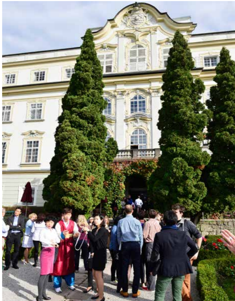
The YCIs gather on the terrace of Schloss Leopoldskron, home of Salzburg Global Seminar

year, young cultural innovators from each of the culture hubs are selected to join the program in Salzburg through a competitive application and nomination process. Over the course of the ten years, a critical mass of cultural innovators will be created in each of the hubs, with the YCIs continuing to work together and collaborate with each other after the session in Salzburg. The Forum’s goal is to create dynamic platforms for engagement that will act as a resource for other young cultural innovators at the local level. Salzburg Global will also encourage collaboration among the various culture hubs to continue the cross-cultural exchange and learning growing out of each Salzburg session.